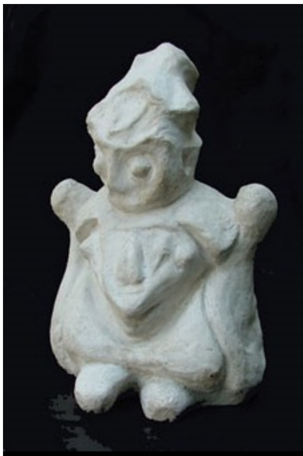
Figure 6. Adelina Gomes. No title (plaster copy of clay modelling), 1950.