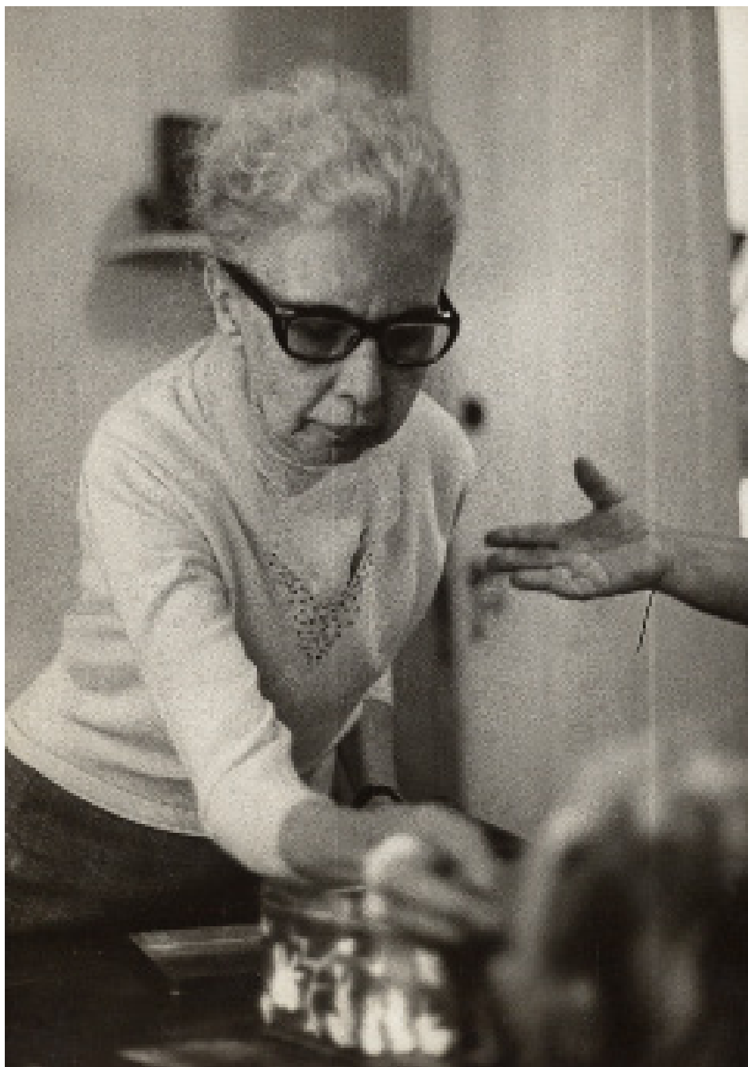
Figure 1. Nise da Silveira