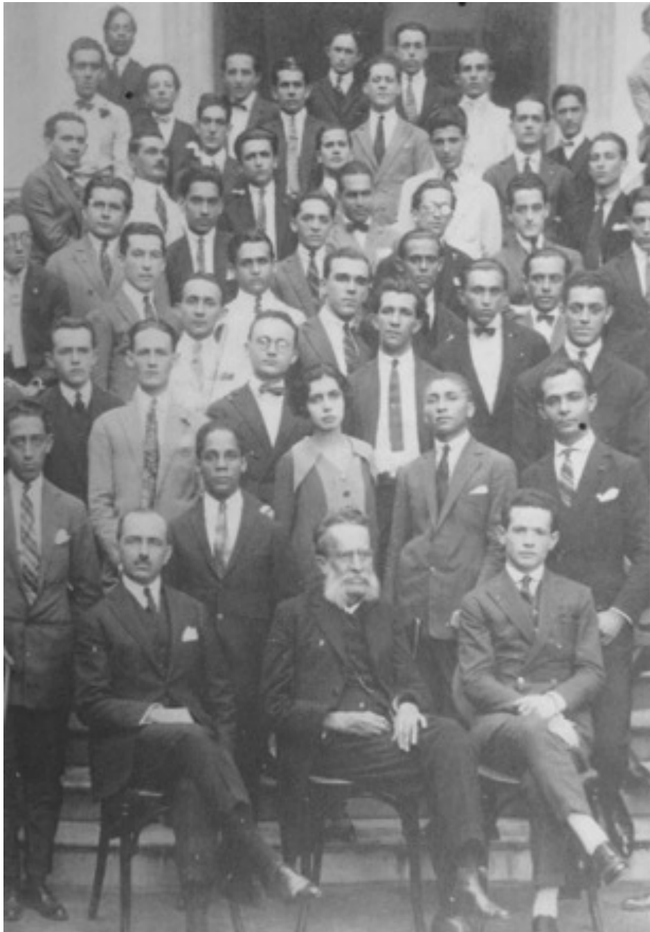
Figure 2. Nise da Silveira with her medical colleagues, 1926. Bahia Faculty of Medicine, Salvador, BA, Brazil.