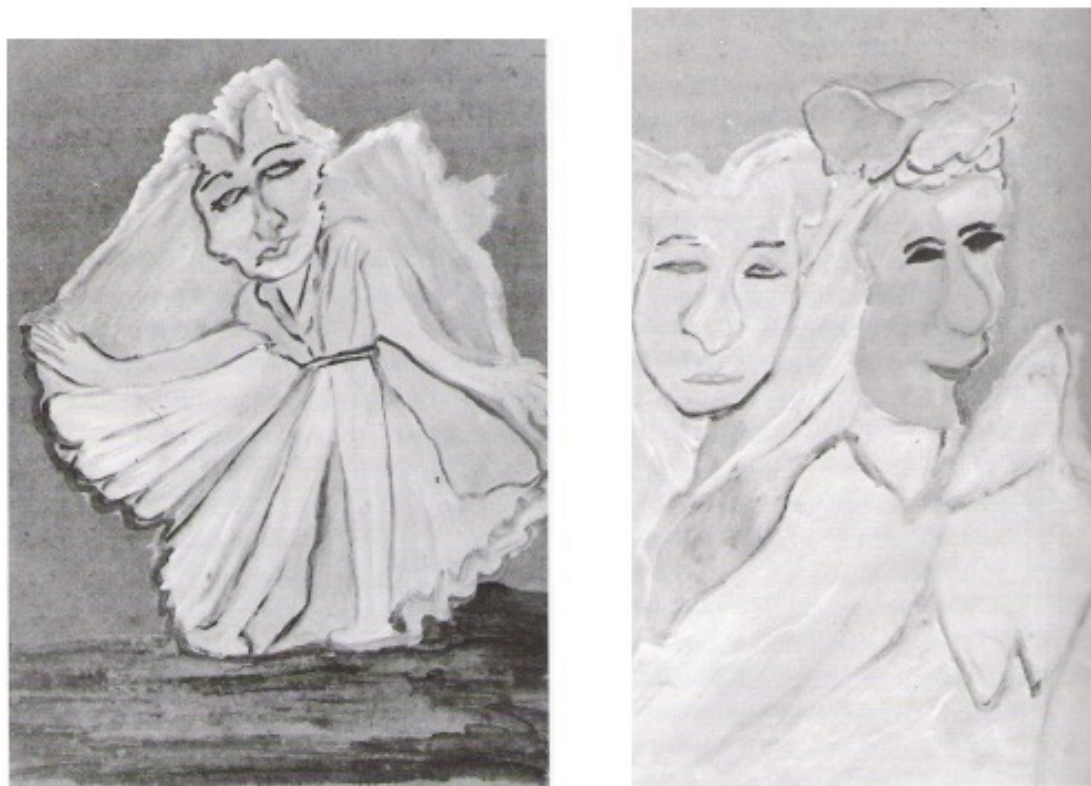
Figure 5. Adelina Gomes' paintings. No title. (n.d.).