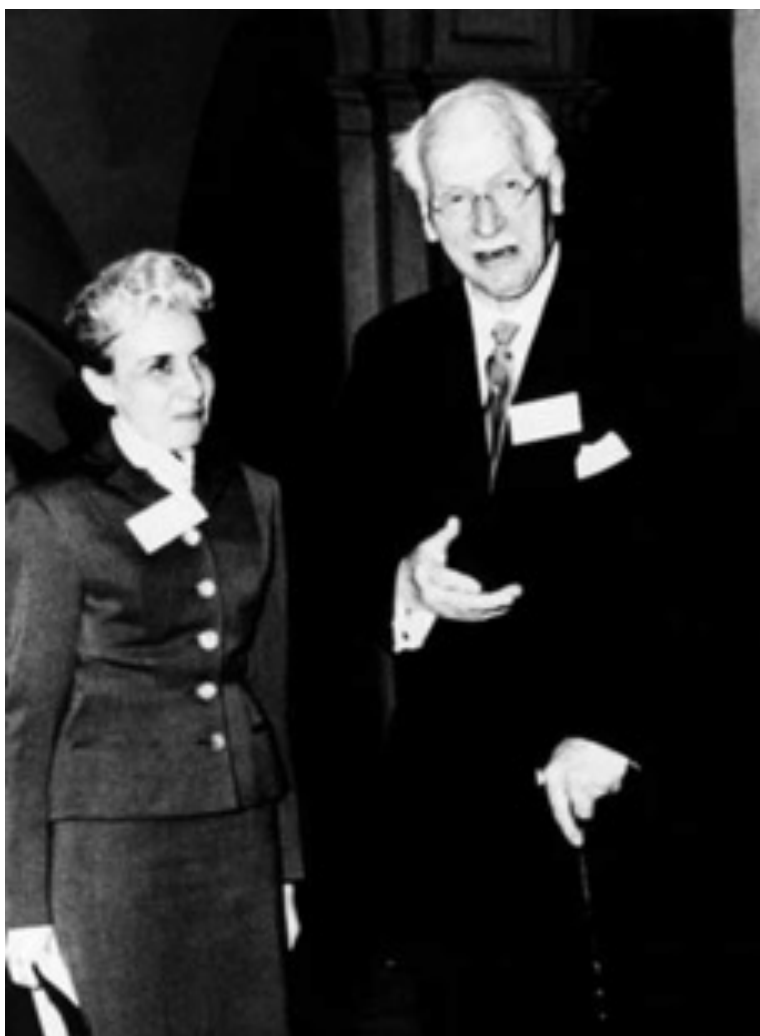
Figure 3. Nise da Silveira and Carl G. Jung at the inauguration of the exhibition at the Museum of the Unconscious, on the occasion of the Second International Congress of Psychiatry, 1957. Zurich, Switzerland.